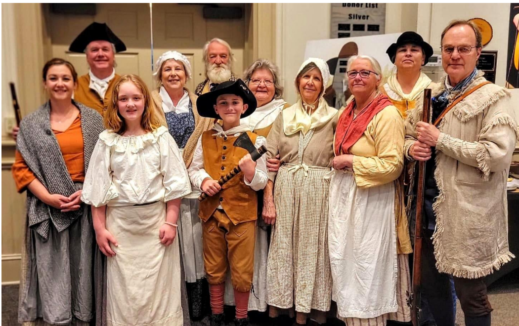
2023 Annual Meeting

Our November meeting will be Nov. 4 in Huntsville, NC near the Shallow Ford crossing on the Yadkin River. This event will celebrate the 275th Anniversary of the Bryans settling at the Yadkin River Valley. You don't want to miss this. Place and time TBD.